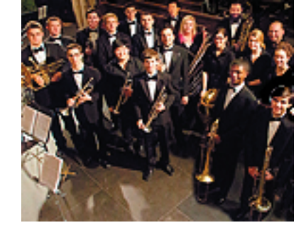
Congratulations Bravo Brass on a wonderful Holiday Renaissance Concert.