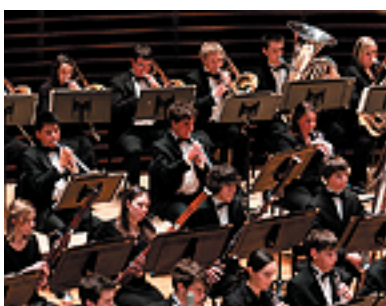
The PYO woodwind and brass sections performing Dvorak's Seventh Symphony on the Verizon Hall stage of the Kimmel Center.

On Sunday, June 6 at 7:30 p.m., the Philadelphia Youth Orchestra (PYO) will perform with an all-star roster at the Kimmel Center's Verizon Hall for its 70th Annual Festival Concert.