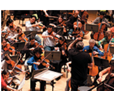
The Philadelphia Youth Orchestra in a side-by-side rehearsal of Shostakovich's Fifth Symphony with musicians of The Philadelphia Orchestra.