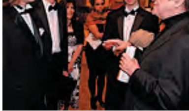
Philadelphia Orchestra Chief Conductor Charles Dutoit provides insight into the career of a professional musician at the Philadelphia Youth Orchestra Gala in 2009.

Our 70th Anniversary Season Gala and Concert are just a few weeks away! Making this year bigger and better than ever, Philadelphia Youth Orchestra has partnered with Studio Incamminati for a private display of fine art which will be available for purchase during our reception at the Union League on Friday, March 12 at 6:00 p.m. A percentage of the sales will benefit PYO's programs and services.